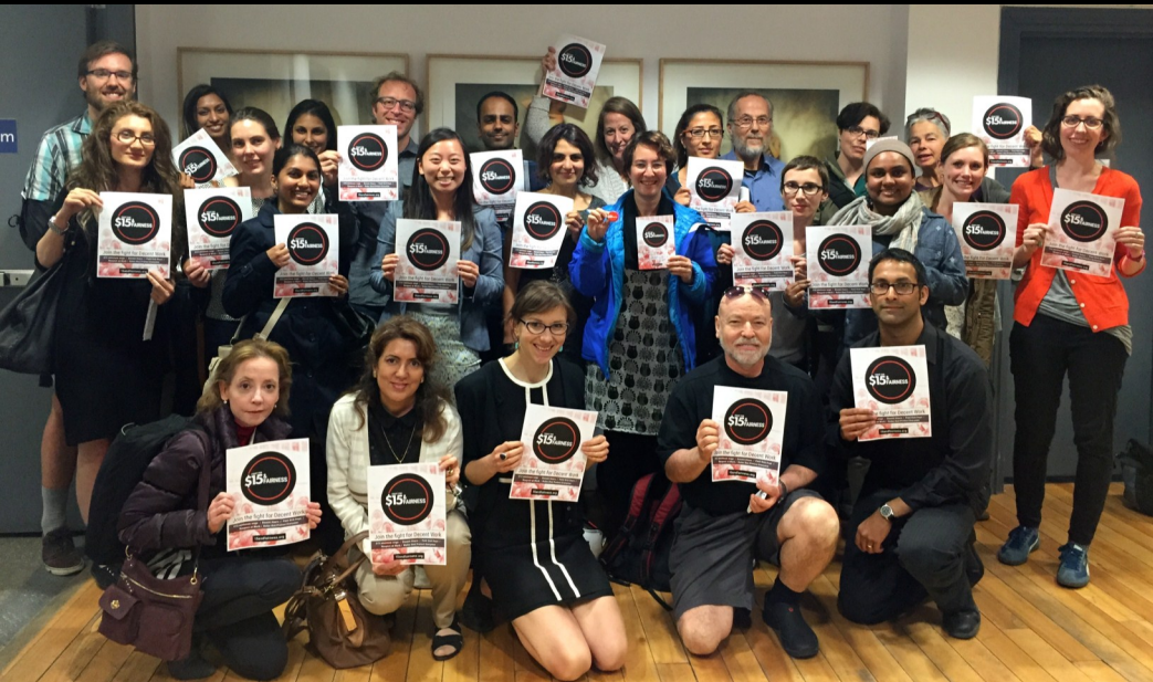
HPAP members supporting the Fight for $15 and Fairness